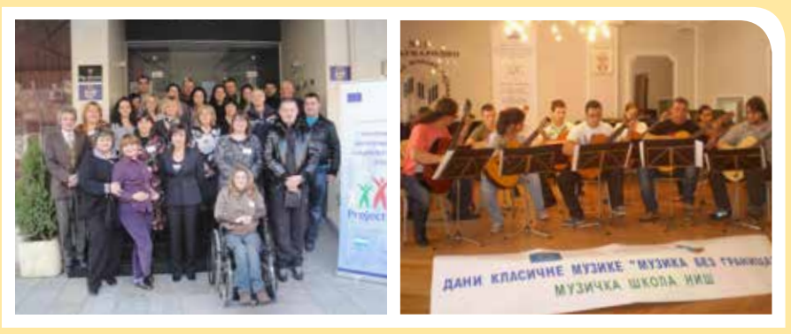
Social services thematic forum in Vidin (left) and a music concert in Nis (right)

2. "Soft-measure" projects and "people-to-people" actions: