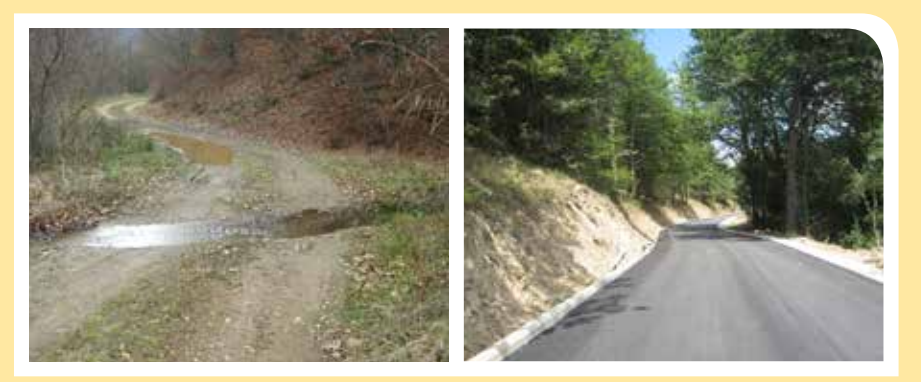
Before (left) and after (right) photos from the project "Reconstruction of the local road in accordance with sustainable development", complementary with Operational Programme (OP) "Regional Development" and OP "Transport".