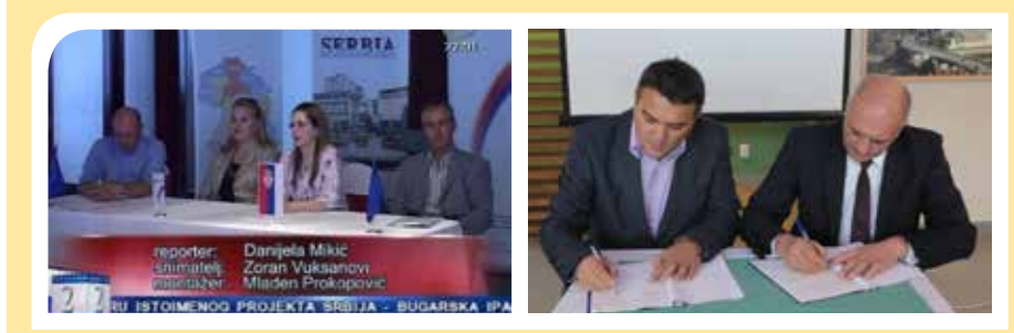
Projects "Exchange of good practices for quality management of municipal administrations" (left) and "Establishment of cross-border network among the Municipal councils in the cross-border region " (right) are complementary with the Operational Programme "Administrative Capacity"