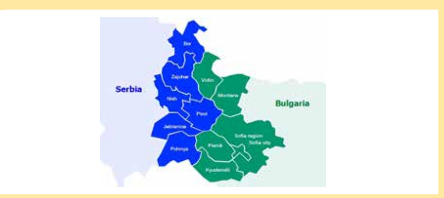
Map of the Bulgaria-Serbia cross-border region

The most specific and probably the most valuable aspect of the Programme is that each and every project has a strong cross-border effect. Each project needs to be able to tackle the needs and the opportunities in the region and should also: focus on the joint vision; allow for stable growth and sustainable development on both sides of the border; take into account the needs of the local resident population, the environmental issues and equality; help building cross-border institutions and capacities for regional development and cultural exchange on a long-term basis.