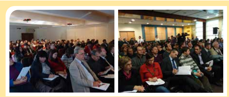
Second Call Information days attracted hundreds of potential beneficiaries, ultimately resulting in a 130% increase in the number of project proposals.